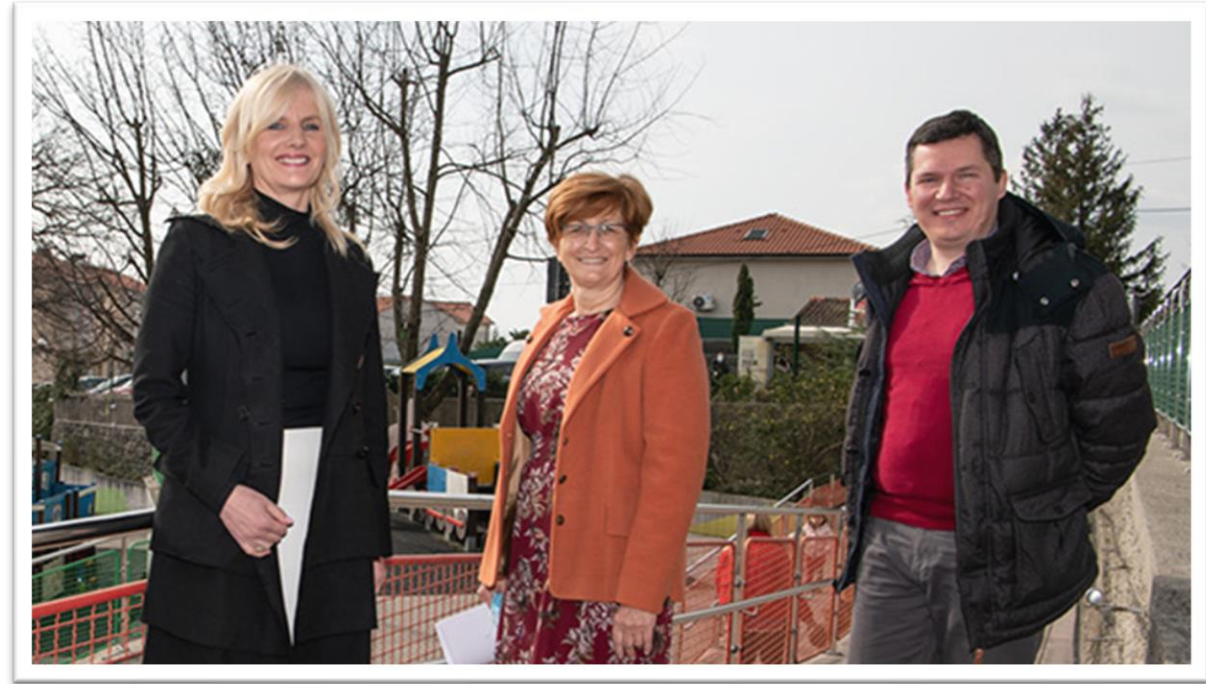
ESF+ project Croatia