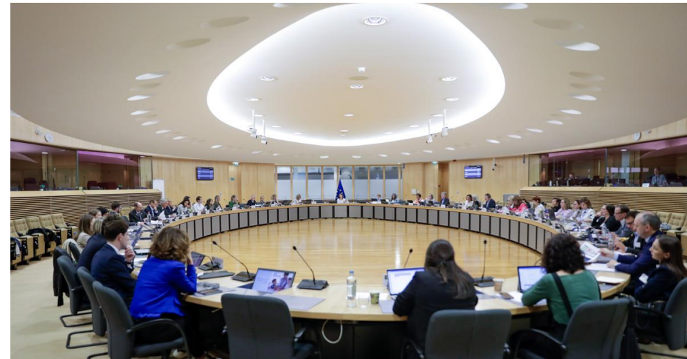
Meeting of the Child Guarantee Coordinators, June 2024